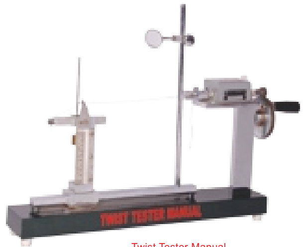
Twist Tester Manual