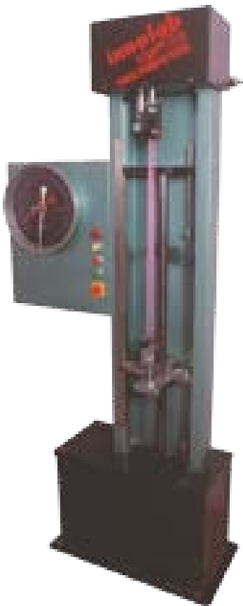
CSP Tensile Strength Tester