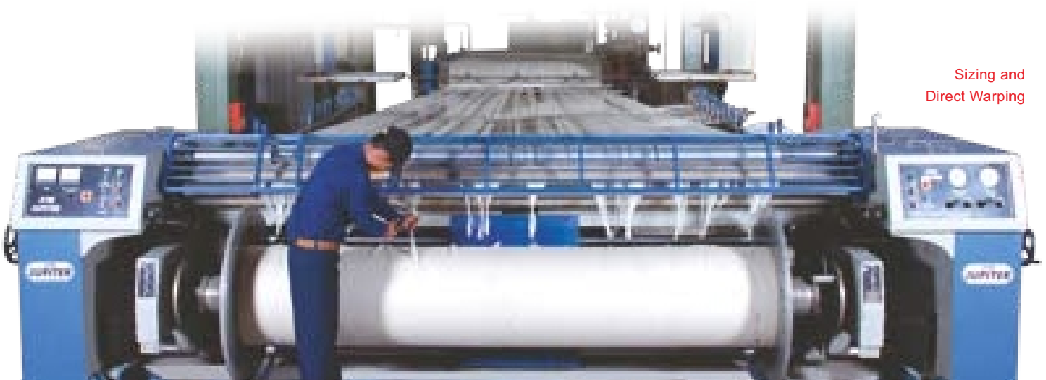
Sizing and Direct Warping