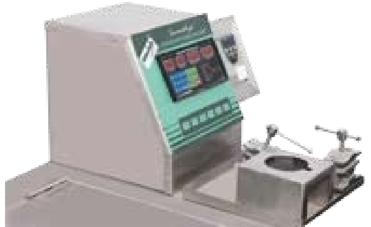
H.T.H.P. Beaker Dyeing Machine