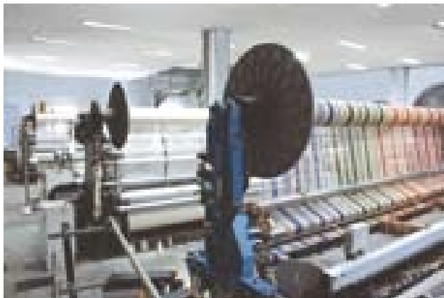
Dobby Looms in the Plant