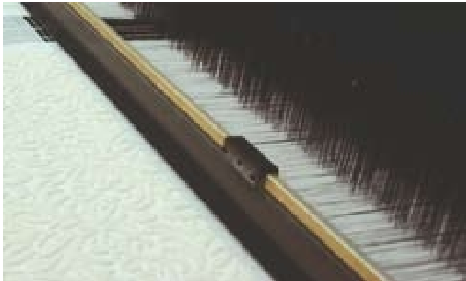
Jaquard Looms in the Plant